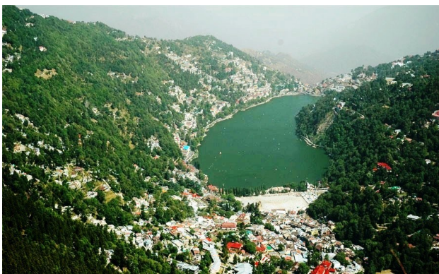
Bird's eye view of Nainital

Bhowali health resort (11 km); Pangot (15 km) famous for bird watching; Bhimtal lake (22 km); Ramgarh (25 km), home of Kumaon orchards; Naukuchia-tal (26 km), a lake known for fishing and migratory birds; Jageshwar (34 km), a Hindu pilgrimage town; Ranikhet hill (54 km); Almora (67 km) known for picturesque surroundings; Chaukori (112 km), famous for fabulous view of the Himalayas; Jim Corbett National Park (113 km), one of India's best known wildlife sanctuaries and tiger reserve; Kausani (120 km), a scenic hill station; and Pithoragarh (188 km) known for charming alpine meadows and glaciers are other tourist attractions near Nainital.