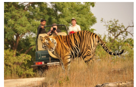
Jim Corbett National Park