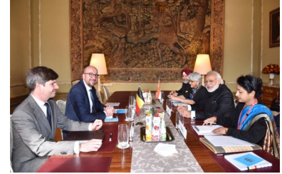
PM meets Prime Minister of Belgium

During the visit, Prime Minister Modi met select Members of European Parliament, leading Indologists, CEOs from various sectors and Board Members of the Association of Diamond Traders. He also addressed the Indian Community in Brussels.